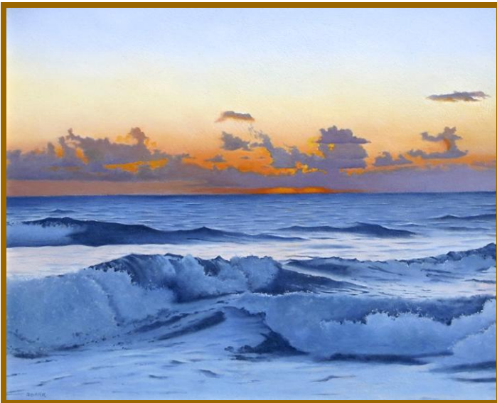
"As Night Falls", 8" x 10", oil on panel