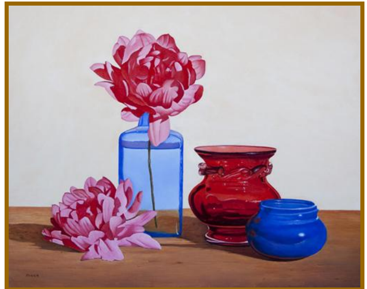
"Pink Beauties", 8" x 10", oil on panel