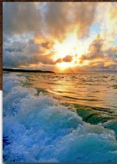
"October Sunset", hand-glazed photo pigment print