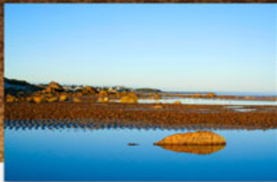
"Summer Morning", hand-glazed photo pigment print