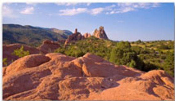
"Red Rocks, Garden of the Gods", hand-glazed photo pigment print