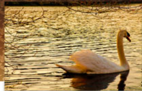
"Spring Swan", hand-glazed photo pigment print