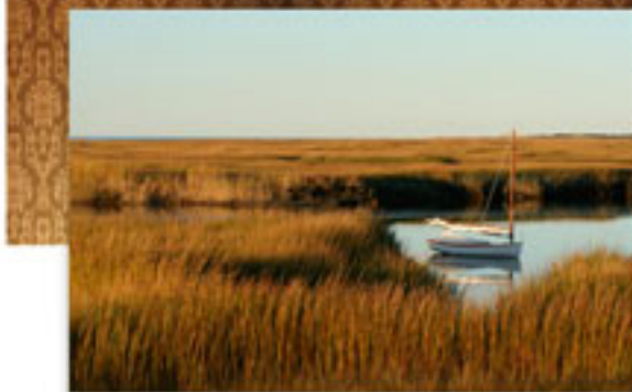
"Safe Mooring", hand-glazed photo pigment print