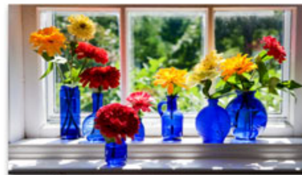
"Summer's Glory", hand-glazed photo pigment print